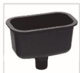
PP Sink resistant to strong acid, alkali and anti-corrosion